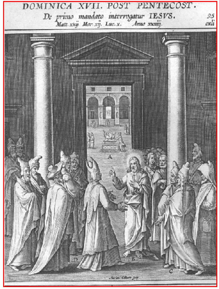
From "Illustrations of the Gospel Stories" by Jerome Nadal - Matthew 22:34-46 Jesus is questioned by Pharisees about the Greatest Commandment .

Our Savior & Peace Lutheran of Lakeland 26 18 18 Sunday after Trinity ⊀ L-G: Law & Gospel October 4 th, 2015 № 9:30am & 11:00am